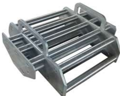
Rectangular Magnetic Grid