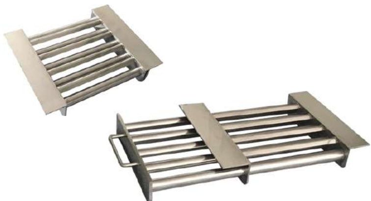
Rectangular Magnetic Grid in Easy-clean type