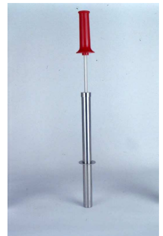
Pull-and-Push Magnetic Attractor